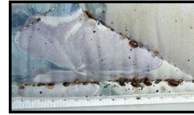
Fig 1 Bed bugs on mattress seams.

Boxes - Carefully inspect boxes or any other items that are on the floor, especially those that are close to the bed or sofa. (see fig 3) We recommend using only plastic storage containers.