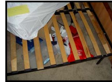
Fig 3 Bed bugs were found in boxes under the bed frame.