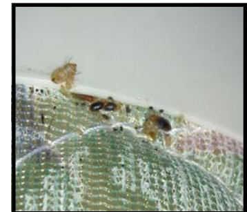
Fig 5 Bed bugs found on the corner of a box spring mattress.