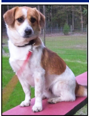
Chili, a young Corgi/Beagle mix was adopted from a shelter in Georgia. He weighs about 19 lbs., has long hair and a gentle personality. But when Chili goes to work you can tell that he's a natural bed bug detective!