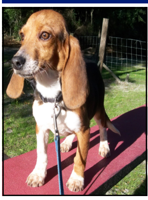
Ranger, a young beagle, comes to us from a rabbit dog breeder in North Carolina. Born with scent detection in his blood, Ranger loves to sniff around for bed bugs. Ranger's brothers and sister are being trained to detect bed bugs too!